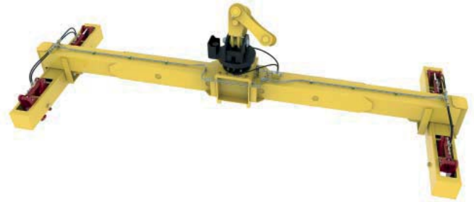
Example: PH16-01-04 Heavy Panel Handler for standard gauge track with straight centre beam, rotator and two-pin adapter head

Each model is available with either a straight or an arched centre beam.