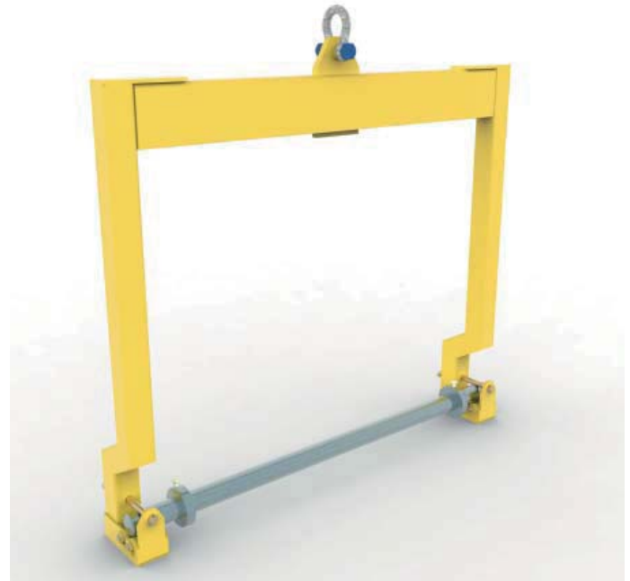
Example: CHY10-02-01 Cable Yoke for 2.4m diameter x 1.5m wide drums with one shaft and collar set

Size 02 can cope with drums up to 2.4m diameter x 1.5m wide weighing up to 4.5 tonnes