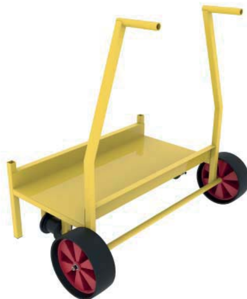
Example: ETS10-01 Trolley Skate with open ended deck

A special version is also available with racking to hold 18 Instant Barrier Posts (see page 110).